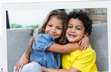
Creating brighter futures